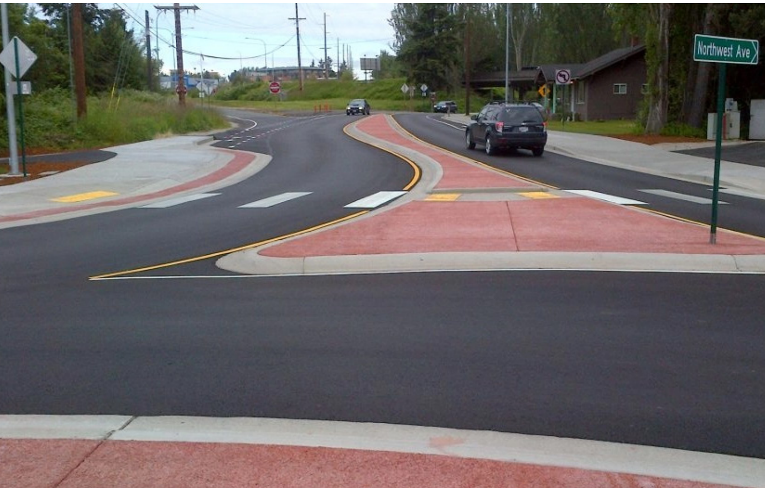
Proposed integral colored concrete in medians