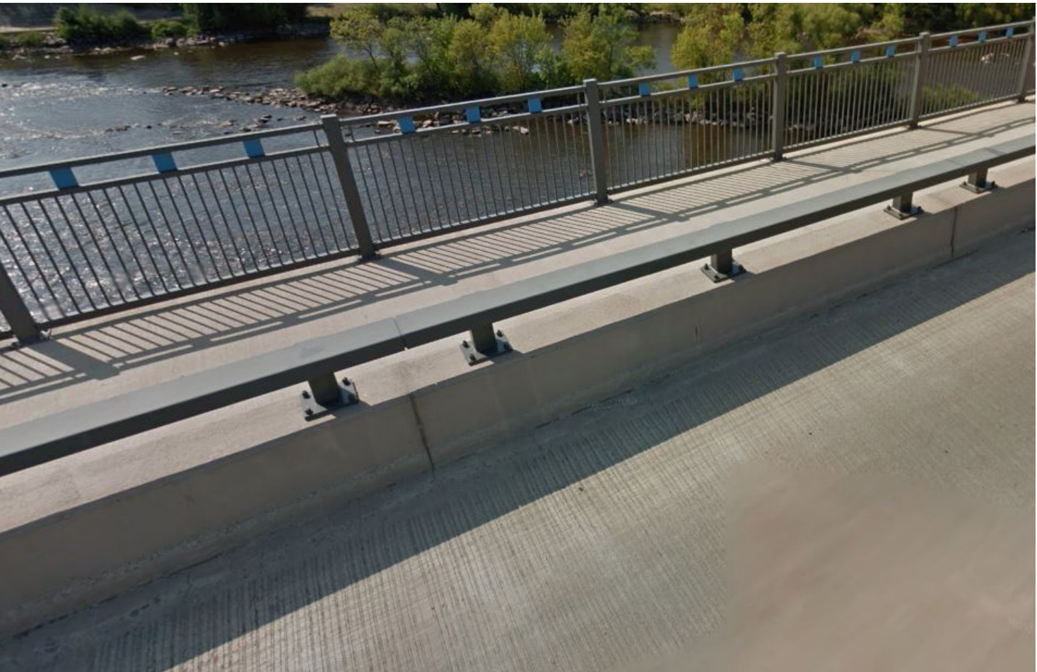
Concrete barrier between sidewalk and traffic lanes on river bridge with tube railing