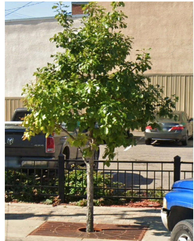
Street trees in select locations