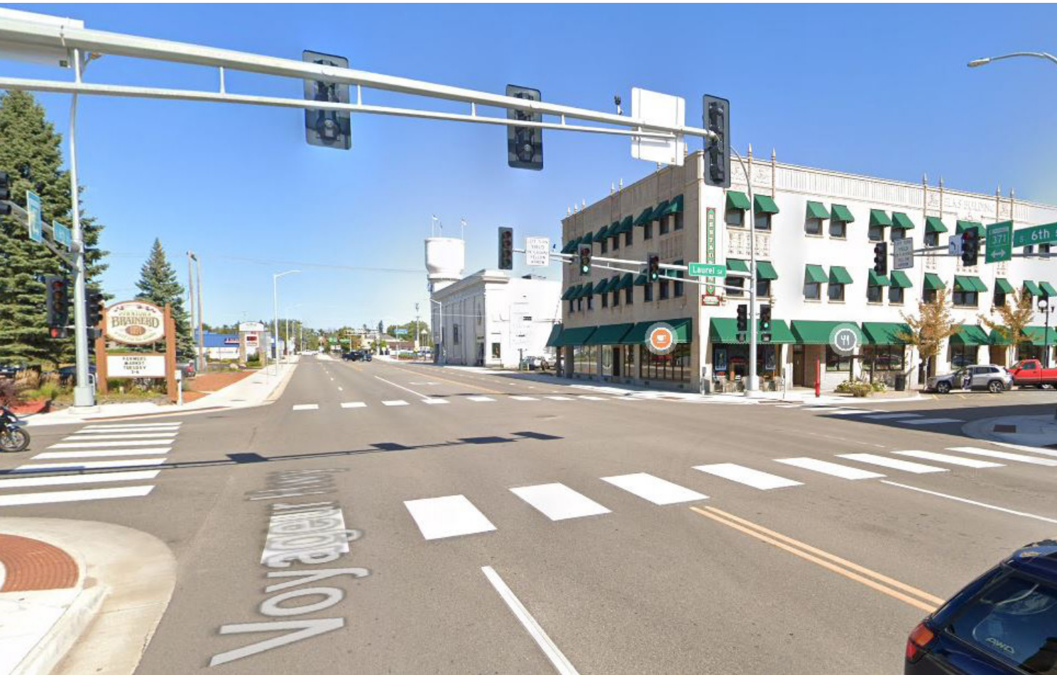
Proposed pedestrian crossings