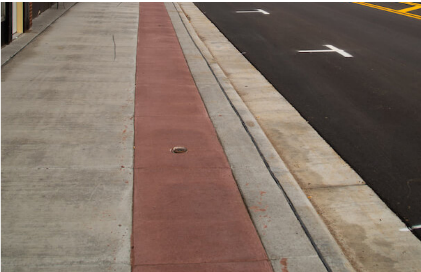
Proposed integral colored concrete along sidewalk