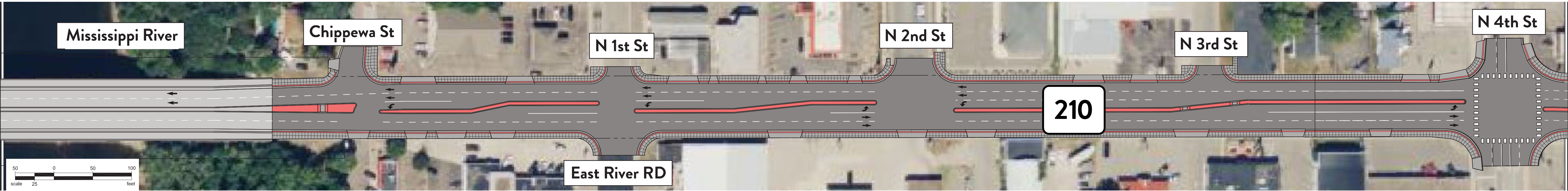
Proposed aesthetic plan