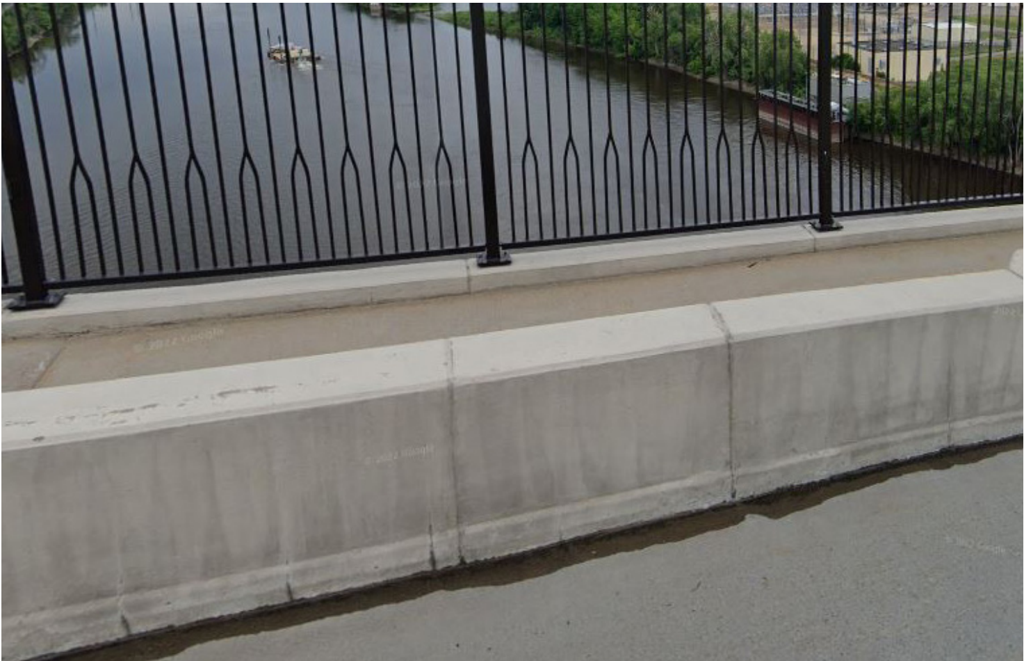
Concrete Barrier between sidewalk and traffic lanes on river bridge